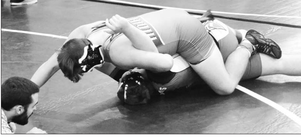
King of the Mountain wrestling photos