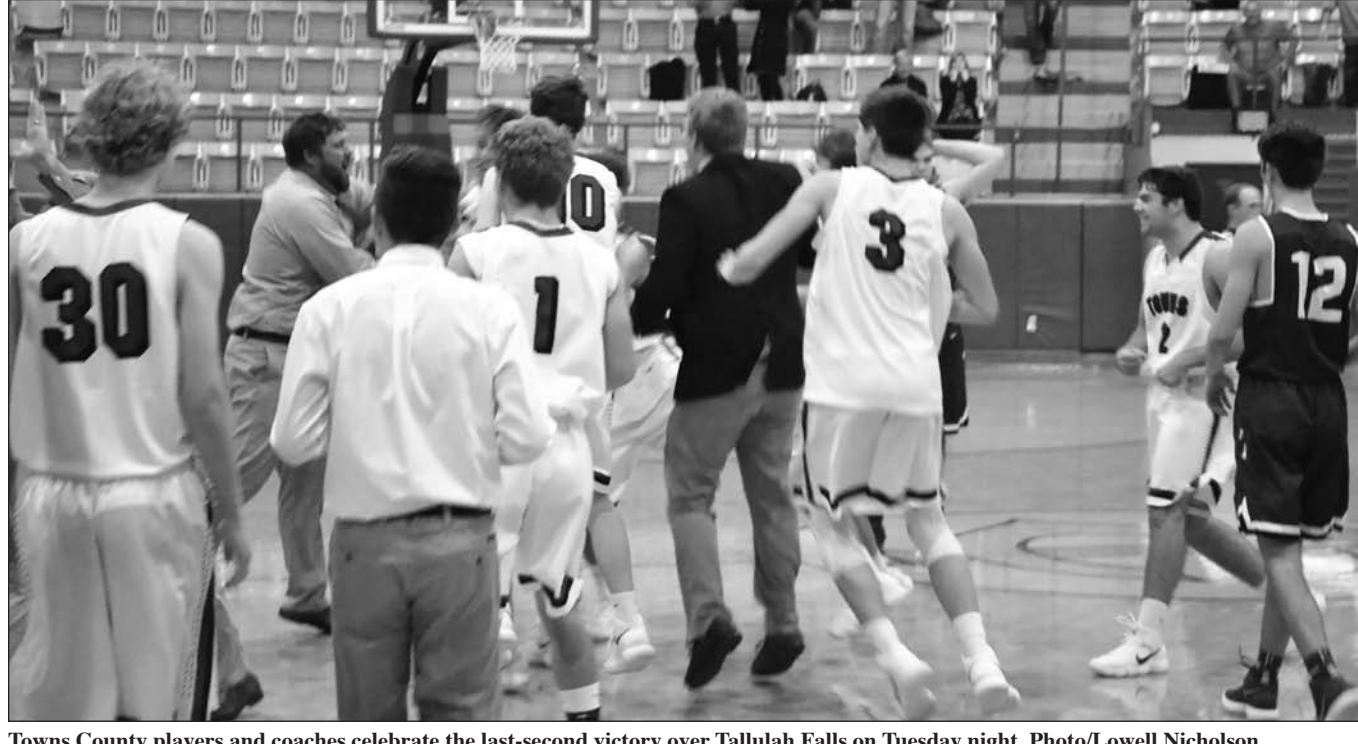
Towns County players and coaches celebrate the last-second victory over Tallulah Falls on Tuesday night.